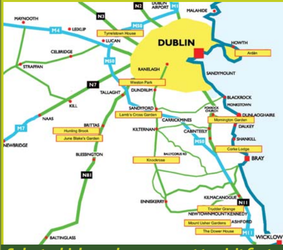
Select which garden you want to visit first... And contact the owner directly to arrange a visit.

The gardens range from historic grand estates to intimate urban oases, from classic and romantic gardens, to contemporary design gems.